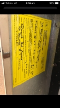
Notification of treatments in the meter box.