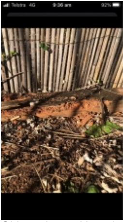
Old termite workings & damage to sleeper.