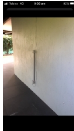
Undetected access obstructions.