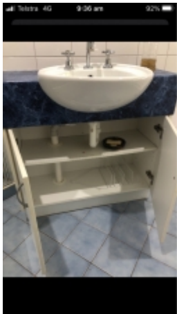
Undetected access obstructions.