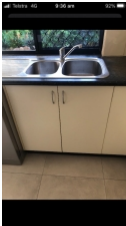
Undetected access obstructions.