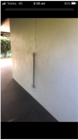
Obstructed slab edge exposure.