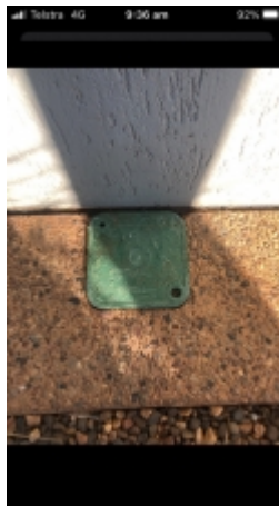
Notification of treatments in the meter box.